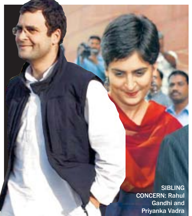
SIBLING CONCERN: Rahul Gandhi and Priyanka Vadra